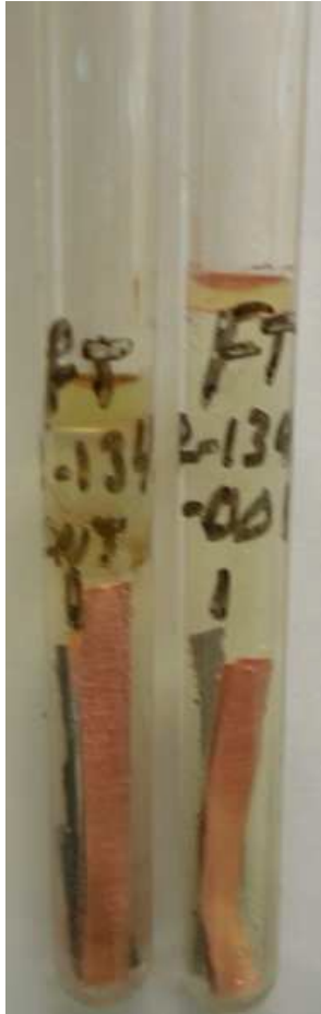
R-134a cnt v 001