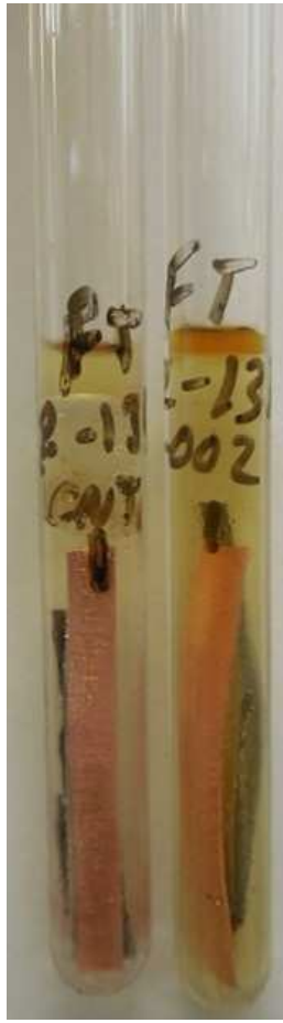
R-134a cnt v 002