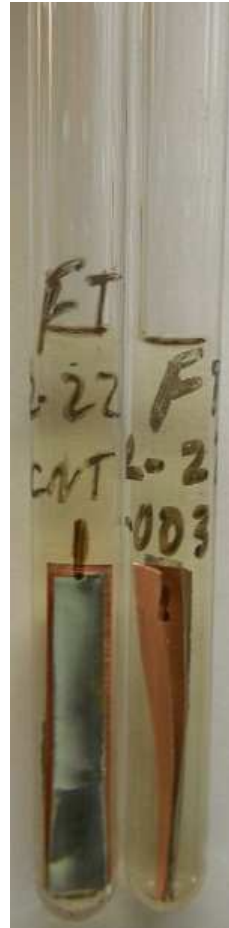
R-22 cnt v 003

This report is for the exclusive use of Intertek's Client and is provided pursuant to the agreement between Intertek and its Client. Intertek's responsibility and liability are limited to the terms and conditions of the agreement. Intertek assumes no liability to any party, other than to the Client in accordance with the agreement, for any loss, expense or damage occasioned by the use of this report. Only the Client is authorized to permit copying or distribution of this report and then only in its entirety. Any use of the Intertek name or one of its marks for the sale or advertisement of the tested material, product or service must first be approved in writing by Intertek. The observations and test results in this report are relevant only the sample tested. This report by itself does not imply that the material, product or service is or has ever been under an Intertek certification program.